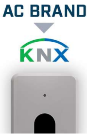
Use Case Integration of Universal Air Conditioners into a KNX installation.