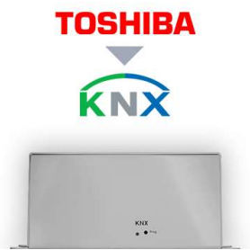
Use Case Integration of Toshiba VRF systems into a KNX installation.