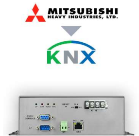
Use Case Integration of Mitsubishi Heavy Industries Air Conditioner Units through Superlink connection into a KNX installation.