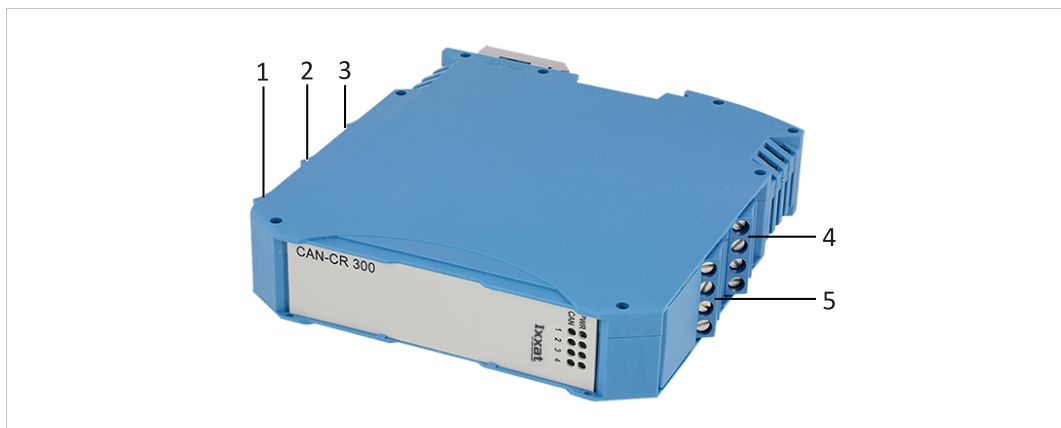
Fig. 3 Connectors