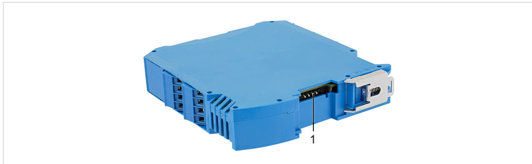
Fig. 1 DIP switches

To operate the CAN repeater no software installation is required. The CAN repeater is configured via DIP switches (1).